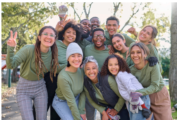
Positive and uplifting network